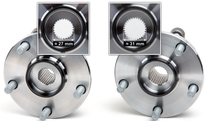
Figure 2: The diameter of the CV Joint spline is different

Two different FAG wheel bearing sets are offered for the abovementioned vehicles. The two wheel bearings are nearly identical to one another and differ only according to the diameter of the CV Joint splined shaft that fits into the wheel hub.